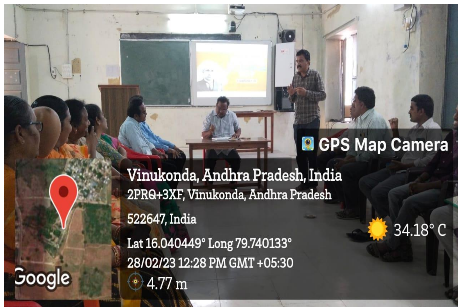
Fig 2 Academic Coordinator speaking on the occasion